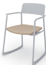
K13-ZZ11C - E2KA1K 1