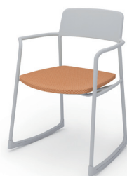
K13-ZZ11C - E2KA43 1