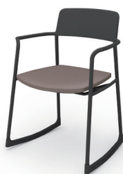
K13-ZZ11C - BKKAM6 1