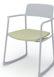
K13-ZZ11C - E2KAV1 1